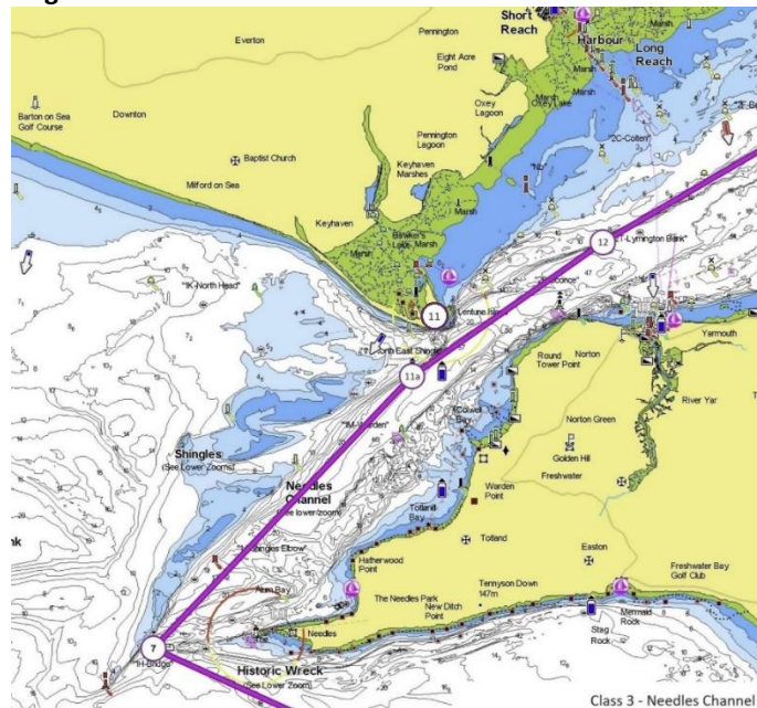
Class 3 - Needles Channel

NB - Lat and Longs are in format - Degrees - Minutes - Seconds - Decimal Seconds not to be confused with decimal minutes as used by many applications including Navionics